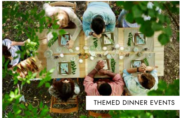
THEMED DINNER EVENTS

To learn more about The Coves Club, please visit www.thecovesclub.com .