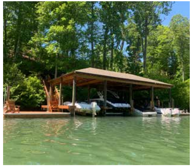
Top Left: The restored barn studio at Southlake Spa and Salt Room located less than 2 minutes from The Coves. Top Right: Public covered boat slips and dock. Below left: One of many lakeside pavilions scattered throughout the development. Below right: a bridge along one of our hiking trails and solar array.