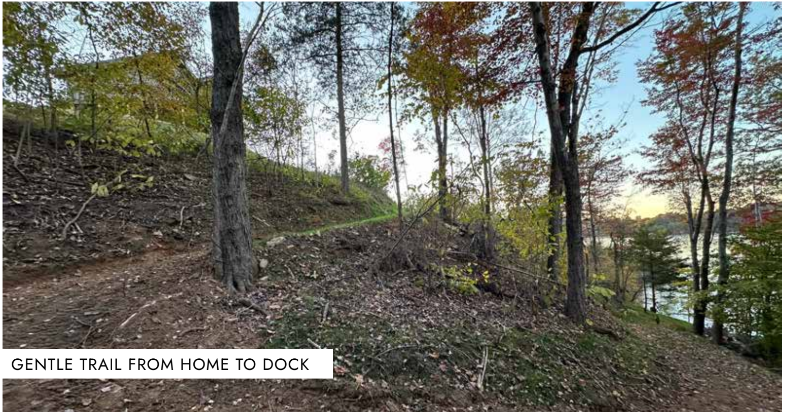
GENTLE TRAIL FROM HOME TO DOCK